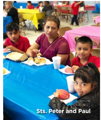
Sts. Peter and Paul